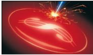
Phase 2: Lengthen Equipment Lifetime