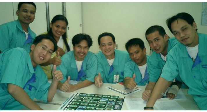
Planned Maintenance Master Class, Sanyo Semiconductor, July 2007