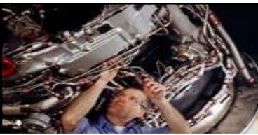
Phase 3: Periodically Restore Deterioration