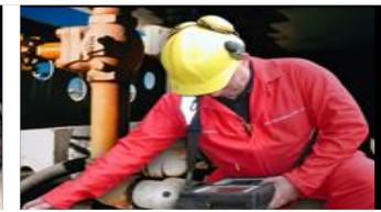
Phase 4: Predict Equipment Lifetime