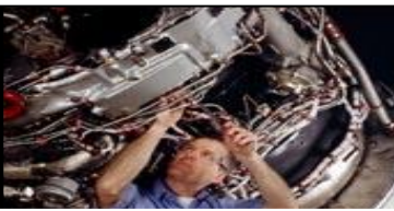
Phase 3: Periodically Restore Deterioration