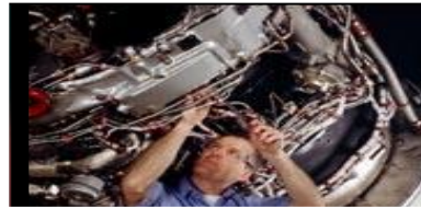
Phase 3: Periodically Restore Deterioration