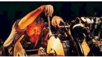
Phase 1: Stabilize Mean Time Between Failure