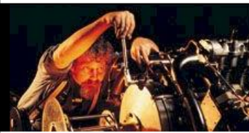
Phase 1: Stabilize Mean Time Between Failure