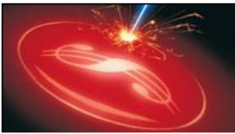
Phase 2: Lengthen Equipment Lifetime