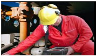
Phase 4: Predict Equipment Lifetime