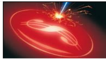
Phase 2: Lengthen Equipment Lifetime