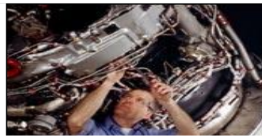
Phase 3: Periodically Restore Deterioration