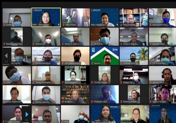
RCFA Webinar, October 6, 2021

Excellent content and very knowledgeable facilitator/trainer. The training provided great opportunity to gain knowledge/new learning's in identifying the root cause of equipment breakdowns. The topic Root Cause Failure Analysis paved a way in giving importance to Predictive Maintenance to effectively practice good maintenance. We were able to classify the difference between physical cause, human cause, system cause and the latent cause. We were able to identify the different kinds of wear which is beneficial in our field as we are handling various equipment in the factory. Good training exercises and workshops. The use of videos that are related to the topic make the training interesting and fun. Mr. Angeles is World Class Trainer. From Krista |Leslie Cars, Area Supervisor, URC Passi