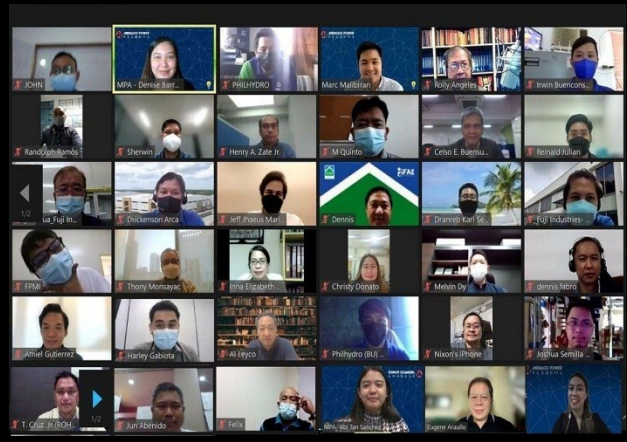
RCFA Webinar, October 6, 2021

Excellent content and very knowledgeable facilitator/trainer. The training provided great opportunity to gain knowledge/new learning's in identifying the root cause of equipment breakdowns. The topic Root Cause Failure Analysis paved a way in giving importance to Predictive Maintenance to effectively practice good maintenance. We were able to classify the difference between physical cause, human cause, system cause and the latent cause. We were able to identify the different kinds of wear which is beneficial in our field as we are handling various equipment in the factory. Good training exercises and workshops. The use of videos that are related to the topic make the training interesting and fun. Mr. Angeles is World Class Trainer. From Krista |Leslie Cars, Area Supervisor, URC Passi