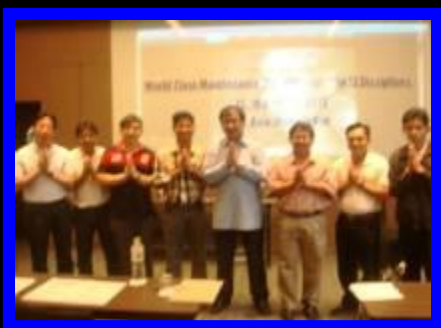
WCM in Thailand October 2013

At RSA Reliability, We Serve Maintenance Mankind Worldwide . . .