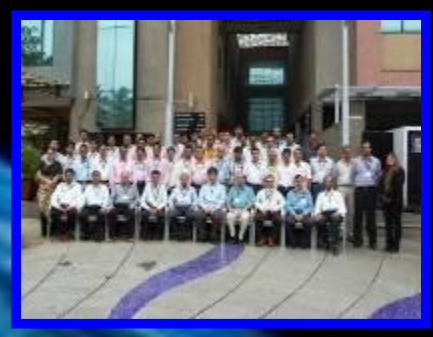
WCM at Bharat Petroleum, India September 2008