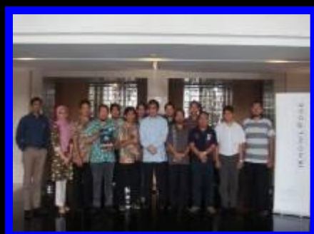
WCM in Indonesia June 2013