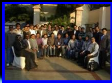
WCM New Delhi, India December 2010