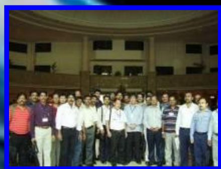
WCM in India, Chennai July 2008