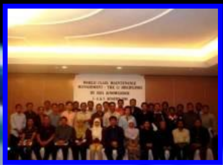
WCM in Malaysia August 2010