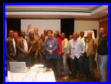
WCM in South Africa June 2012