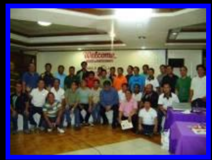
WCM at EDC, Philippines November 2011