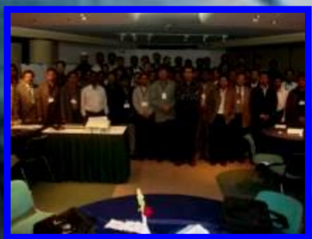
WCM in Bangladesh November 2009